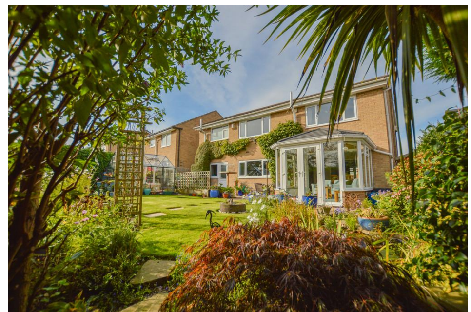
Shillbank View Mirfield, Kirklees