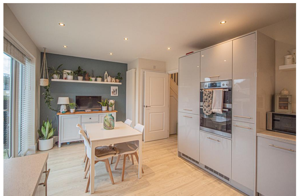
Willow Gardens Scissett, Huddersfield